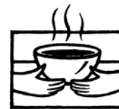
Feeding Friends Meal

If you would like to help on Calvary's week to help FBC serve the Thursday meal (every third Thursday, 5—7 PM), please contact the church office to be added to the volunteer list. You will be contacted about when you are able to serve.