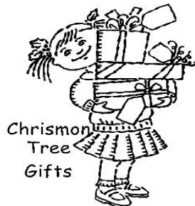
Christmas Tree Gifts